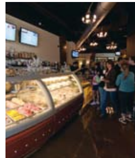
VOVITO CAFFÈ & GELATO 425.502.7522

Chocolate Graham Cracker. Lemon Coconut. Peanut Butter and Jelly. These are just a few of the imaginative flavors you'll find at Trophy, where cupcakes are a work of art, as delicious as they are beautiful. Baked fresh every morning with the finest quality ingredients. Having a celebration? Make it unique with custom cupcakes designed exclusively for you. Then find everything else you need to make your party special from cards to decorations.