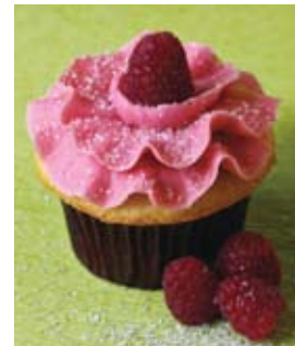
TROPHY CUPCAKES 206.632.7020