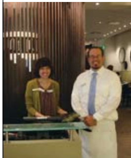
MARIPOSA (at Neiman Marcus) 425.452.3333

Stroll beautifully landscaped pathways or relax by one of the outdoor fireplaces. Check out the season's hottest fashions at the unrivaled collection of shops, including the region's only Neiman Marcus. Treat yourself to a facial at a legendary spa. Or simply indulge yourself and feast on the sumptuous creations of some of the region's most acclaimed chefs. However you choose to enjoy The Shops at The Bravern, it is sure to be an experience like none other.