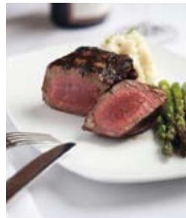
JOHN HOWIE STEAK 425.440.0880

Appetite for excellence. Upscale contemporary cuisine featuring Neiman Marcus Classics with the traditional NM favorites: popovers with strawberry butter, chicken broth, orange soufflé and chicken salad. Find it on the third floor of Neiman Marcus.