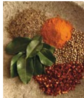
WILD GINGER 425.495.8889

The definitive Northwest steakhouse, serving custom-aged USDA Prime steak, American Style Kobe and Japanese Wagyu beef, as well as fresh seasonal fish, seafood and chops. Featuring mesquite coal and applewood grills to bring out the best flavors. Over 60 wines by the glass and more than 600 bottle selections, classic and seasonal cocktails and the world's finest single-malt scotch and fine cognacs. Live music in the piano lounge nightly.